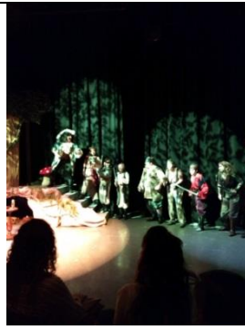
Captain Hook and his crew close in on the Lost Boys secret hideaway.