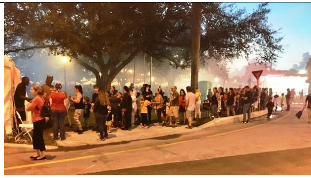
The “Haunted Tent” was open for two two-hour sessions. The line to get in stretched half-way around the circle.