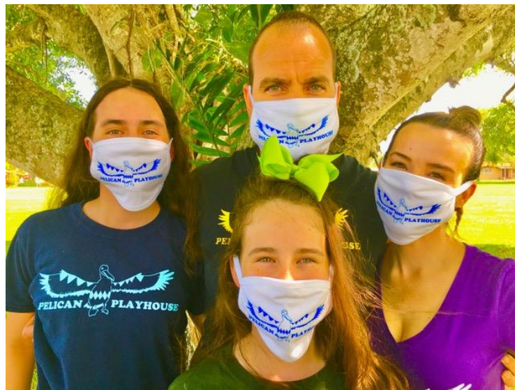
The Calil family sports their new PPPs: Pelican Pandemic Protectors.

Only God knows, but we at the Pelican Playhouse are willing and ready to give it our all!