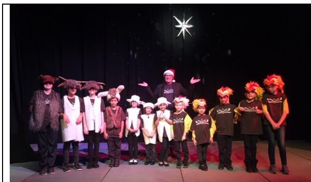
The Great Manger Mystery first dress rehearsal with their Santa Director.

Every Christmas, my “Acting For Young People” class performs for the Miami Springs Seniors from our Senior Center. This year, twelve of our pint-sized players performed “The Great Manger Mystery.” They portrayed the animals (a donkey, a camel, two oxen, three sheep and five chickens) living in the stable the night a mysterious visitor came. It made the audience laugh and touched the hearts of the more than 100 that attended.