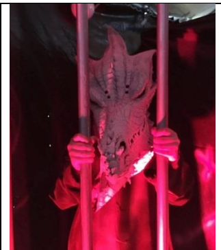
Beyond this point, there be dragons.

Every Christmas, my “Acting For Young People” class performs for the Miami Springs Seniors from our Senior Center. This year, twelve of our pint-sized players performed “The Great Manger Mystery.” They portrayed the animals (a donkey, a camel, two oxen, three sheep and five chickens) living in the stable the night a mysterious visitor came. It made the audience laugh and touched the hearts of the more than 100 that attended.