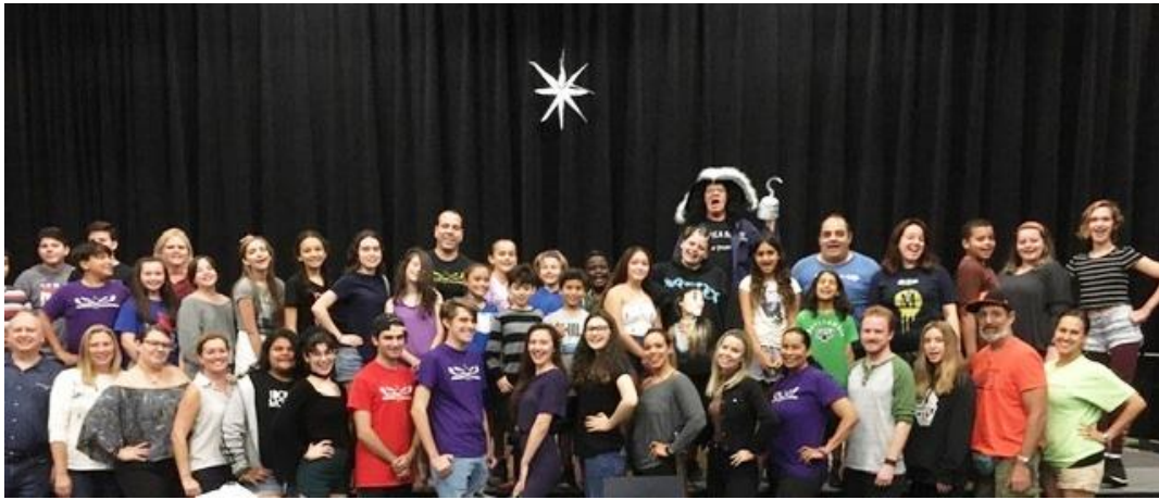
Early September, the Company put out a players call for “Peter Pan the British Musical” The first reading was well attended.