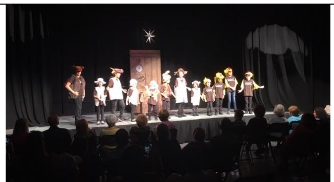
A full house of Seniors, friends and family watched the story of the animals in the Manger and their mysterious visitor.