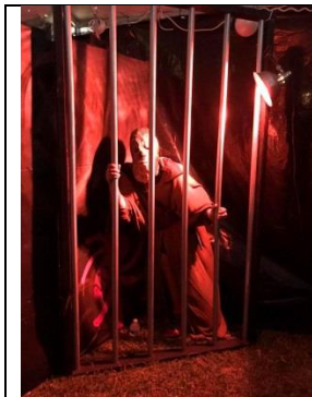
Halloween is always Werewolf Time.