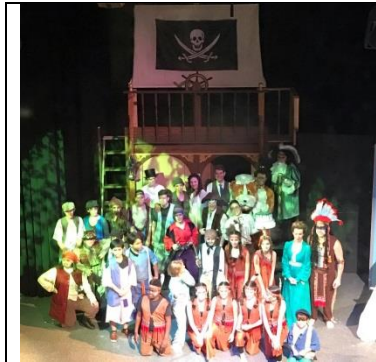
The entire Peter Pan cast aboard Hook's Jolly Roger

After 12 weeks of rehearsal Peter Pan the British Musical opened to two solid weeks of sold out houses.